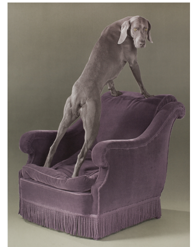
Selection Criterion: Minnesota State Fair Votes William Wegman, Backview , 1993, photolithograph on paper.

Visitors will have the first view of the summer exhibition WAM@20: MN celebrating twenty years in the Gehry-designed building.